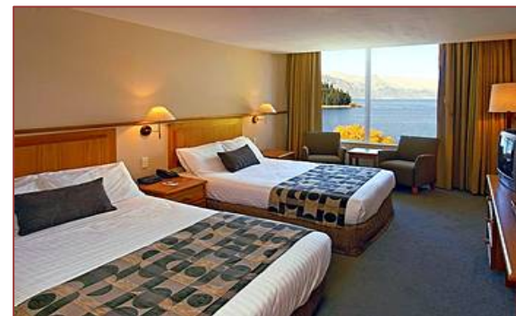
Deluxe room with lake view Room rate NZ179.00 per night (including tax)